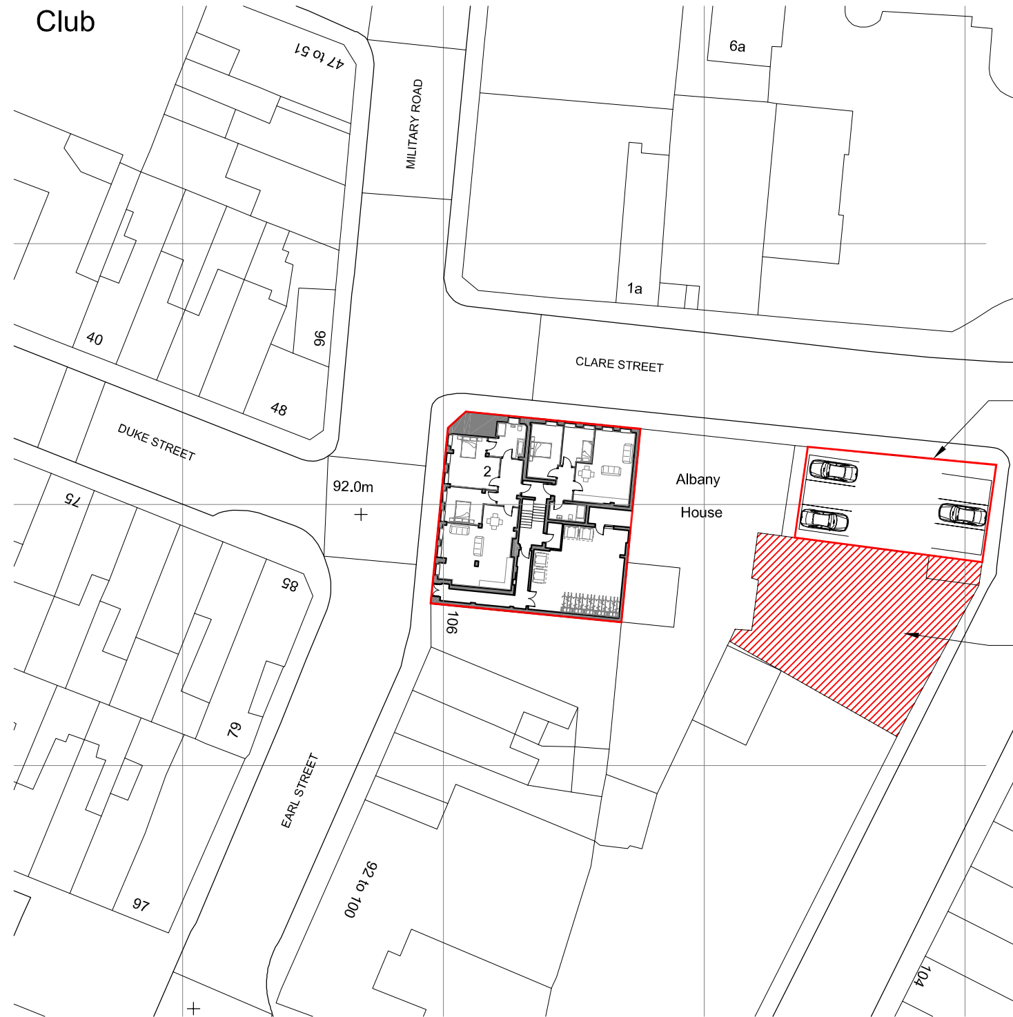
Proposed Block Plan 1:500@A3